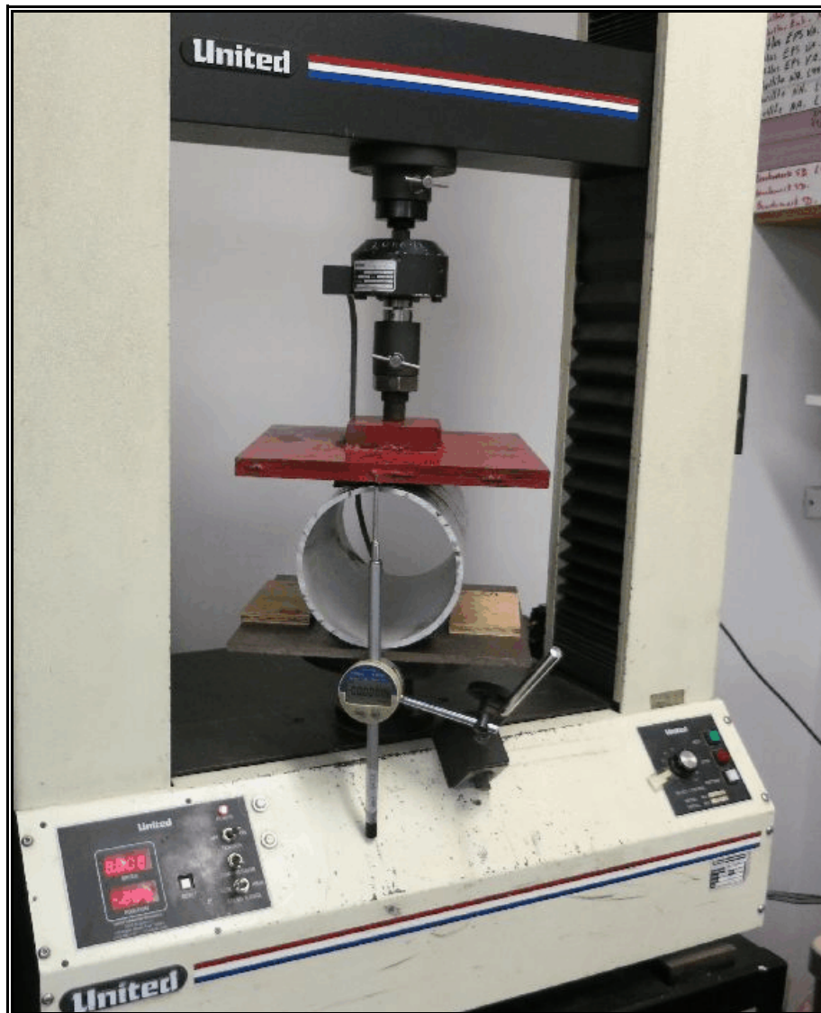
ASTM D2412, Strength Test, UTM Test Setup